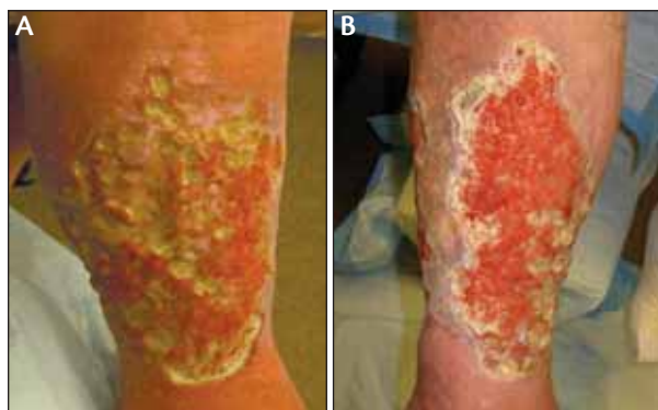
Figure 1. A 62-year-old man without diabetes who was a heavy smoker scratched his leg on barbed wire (A). Within 2 hours of flushing with superoxidized water under pressure, soaking in superoxidized water and wound dressing, there was a clear reduction in bioburden (B).

ential roughly 5 months prior to his referral to the specialty wound clinic. At the time of referral, the patient had been advised to undergo above-knee amputation (Figure 1A).