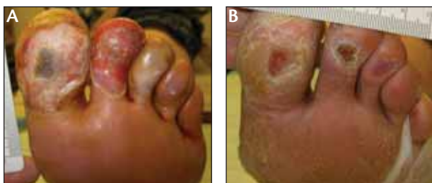
Figure 7. This insulin-dependent, heavy smoker had small ulcers and subsequent second- and third-degree burns (A). Daily soaks in superoxidized water healed the wounds enough for the patient to return to his primary care provider (B).

to enable this patient to return to his primary care provider for ongoing care (Figure 7B).