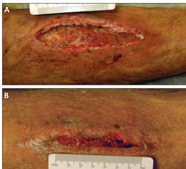
Figure 2. A 53-year-old man sustained an abrasion to his shin (A). By day 8 the lesion was largely resolved following flushing with superoxidized water and dressing (B).

We cultured the wound and found several Pseudomonas species, two of which were not sensitive to any of the antibiotics tested. We thoroughly flushed the wound with superoxidized water under 8 pounds per square inch (psi) of pressure to remove crusted matter and disrupt the abundant, mucopolysaccharide biofilm. We then used several liters of superoxidized water to soak the leg for 30 minutes. We dressed the wound with antimicrobial gauze and constructed an overlying, moderately compressive bandage system. Within 24 hours, we were able to see marked