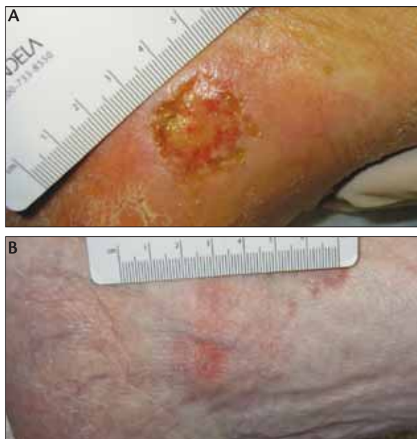
Figure 8. A 54-year-old insulin-dependent woman with a pressure ulcer and severe neuropathy (A). Despite the presence of E. coli , daily washes with superoxidized water and dressing resulted in complete healing within 12 days (B).

For burns, treatment protocols will include avoidance of petrolatum-based ointments/dressings, flushing with copious amounts of superoxidized water as often as every