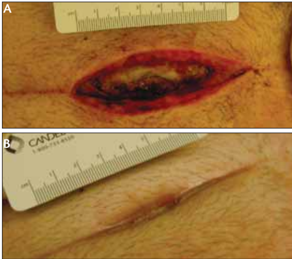
Figure 4. A 49-year-old cholecystectomy patient had a subsequent infection and abdominal wall abscess (A). Only five dressing changes were needed in addition to flushing with superoxidized water to heal the wound (B).

delivered under 8 psi pressure. We loosely packed the wound with antimicrobial gauze and used more of the same as a bulky, overlying bandage. We repeated this treatment twice weekly. By day 21, the lesion was closed completely (Figure 3B).