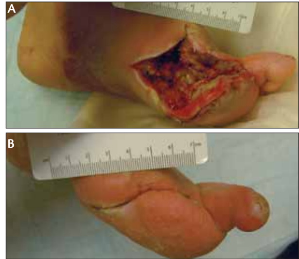
Figure 6. A 45-year-old insulin-dependent woman had ray amputation secondary to developing a nonhealing ulcer and gangrene (A). The wound was soaked in superoxidized water and dressed. By day 40, the wound was healed (B).

care and antibiotic administration. We flushed the lesion with superoxidized water and provided the patient with an offloading sandal. The combination of offloading, antibiotics via superoxidized water only, vascular enhancement caused by the superoxidized water administration and insititution of glycemic control resulted in rapid healing (Figure 5B).